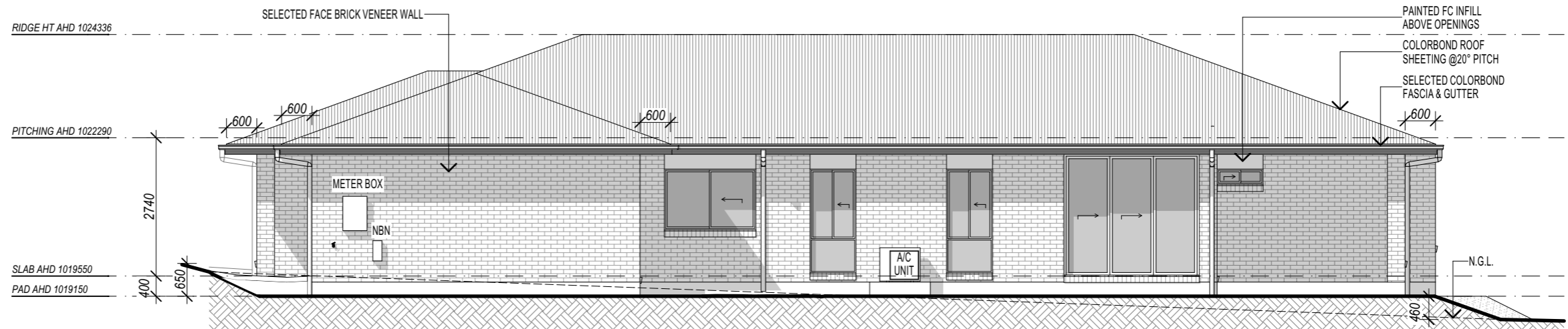
RIGHT Elevation - North Scale 1:100