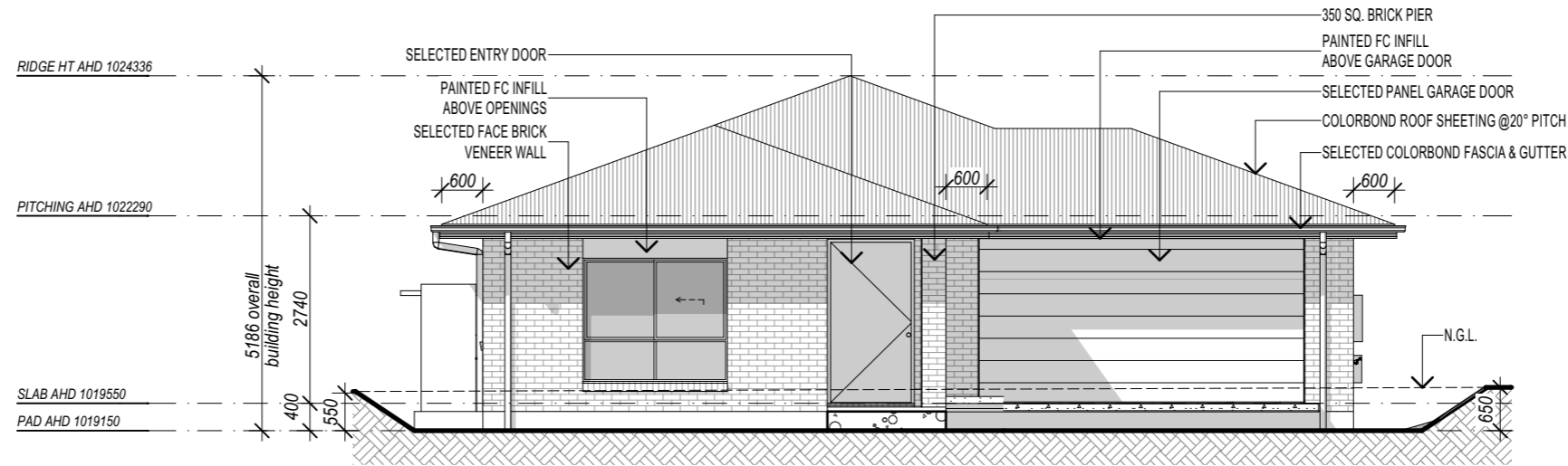
FRONT Elevation - East Scale 1:100

ENSURE FULL ARCHITRAVE OVER WINDOWS TO (2180) BULKHEAD