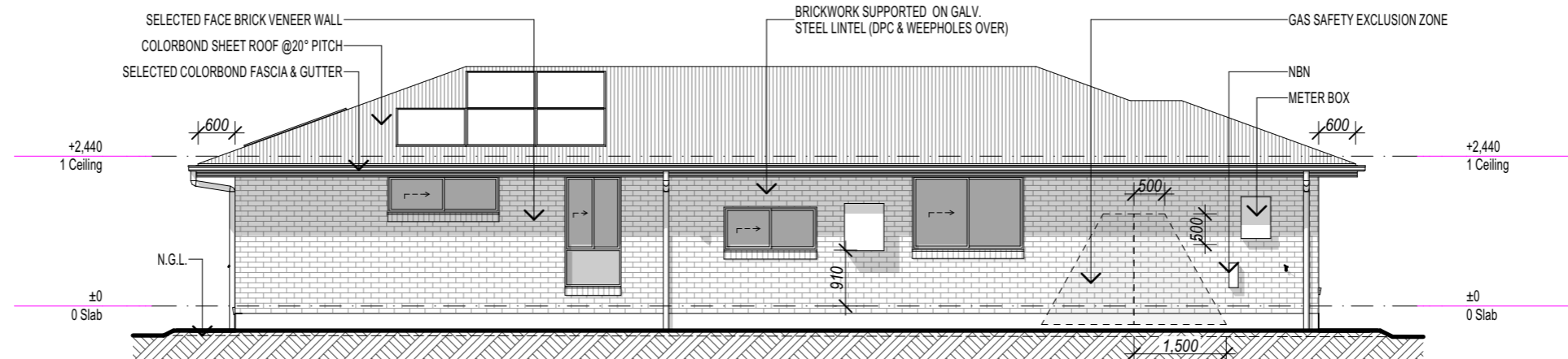
LEFT Elevation - NORTH-WEST Scale 1:100

NOTE: GUTTER, FASCIA AND DOWNPIPES TO BE INSTALLED TO MANUFACTURER'S DETAILS AND TO COMPLY WITH CURRENT NCC. ROOFING TO BE FIXED IN ACCORDANCE WITH MANUFACTURER'S SPECIFICATIONS FOR N2 - METAL ROOF/ 90mm EXT. FRAME @600 CRS. CONDITIONS STEEL ROOFING TO COMPLY WITH H1D7 NCC VOL.2-2022 ABCB PART 7.2 AND AS1562.1-2018 CONCRETE ROOFING TO COMPLY WITH H1D7 NCC VOL.2-2022 ABCB PART 7.3 AS2049-2002/AS2050-2018. PROVIDE ALCOR BARRIER BETWEEN LEAD FLASHING AND ZINCALUME VALLEY GUTTER AS REQUIRED. MASONRY CONSTRUCTION TO COMPLY WITH NCC VOL.2-2022 SECTION 5 ABCB AND AS 3700-2018/AS 4773.1 AND AS 4773.2-2015. WEEPHOLES MAX 1200 CTRS. TO COMPLY TO PROV' CLAUSE H1D5 OF NCC VOL.2-2022 & CLAUSE 5.7.5 OF ABCB. BRICK PATTERN IS SHOWN FOR ILLUSTRATION PURPOSES ONLY - BRICK SETOUT SHALL BE DETERMINED BY THE BRICKLAYER. VERTICAL ARTICULATION JOINTS TO COMPLY WITH THE PROVISIONS OF PART 5.6.8 ABCB OF THE NCC VOL.2-2022. PROTECTION OF WALL TIES & LINTELS IN MASONRY TO COMPLY WITH PROVISIONS OF PART 5.6.5 ABCB OF NCC.