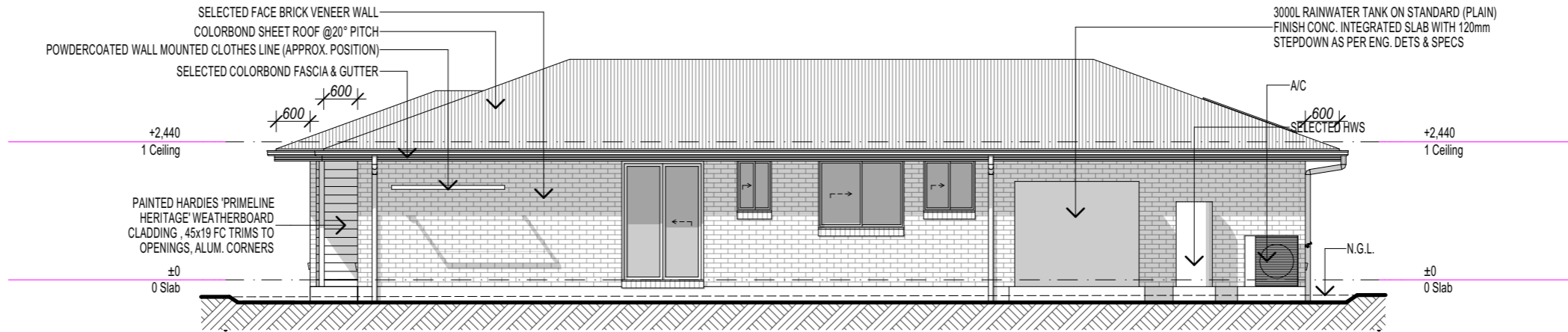
RIGHT Elevation - SOUTH-EAST Scale 1:100

BAL 12.5 To comply with bushfire attack level 12.5 to AS3959-2018