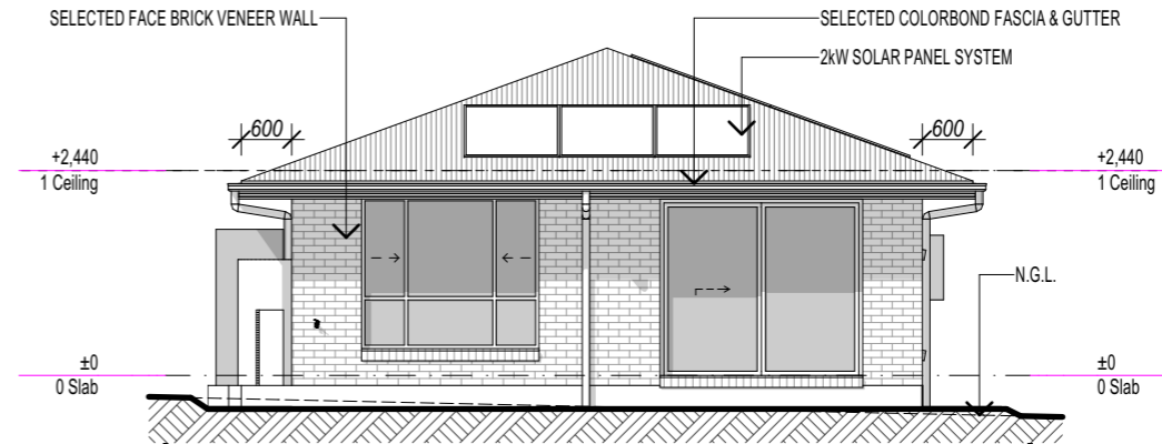
REAR Elevation - NORTH-EAST Scale 1:100