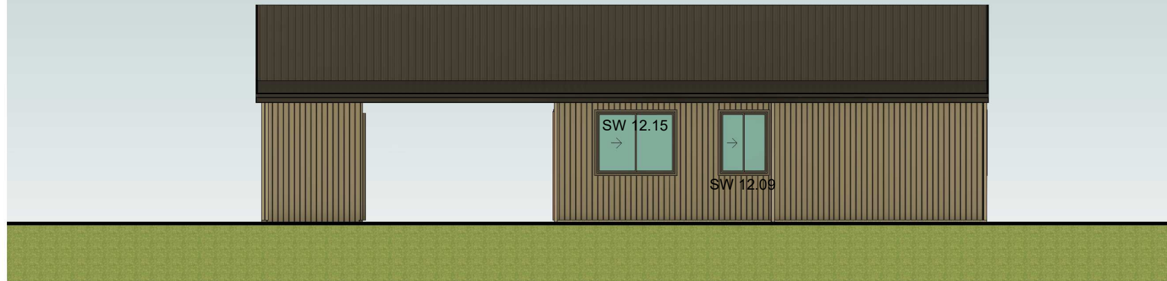
1 ELEVATION SOUTH 1 : 100