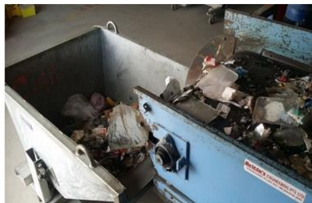
Figure 2: Waste management facilities at USC