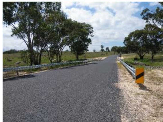
Table 3: Roads sealed by USC at LGA between 2017 and 2021

Since 2017, the council has upgraded more than 15 km of unsealed roads to sealed (Table 3).