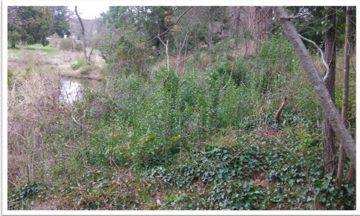
Privet weeds at Rocky Creek, Alma Park