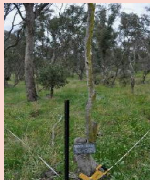
Biodiversity assessment at Wooldridge Fossicking Area on Rocky River, 2020

Future management should aim to prevent grazing and keep vehicle traffic off woodland areas. Firewood should not be harvested from these sites as Coarse Woody Debris (CWD) levels are well below benchmark conditions.