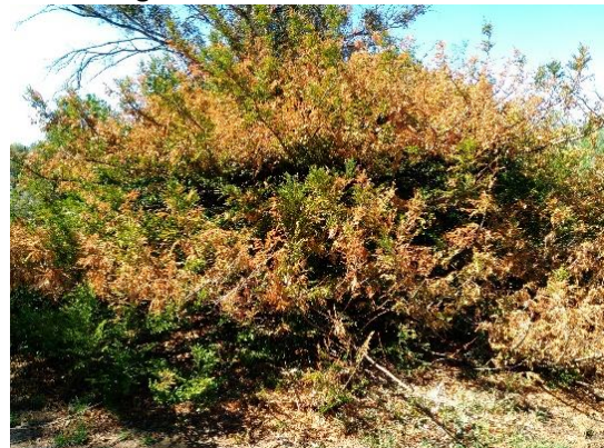
Water stressed tree at Alma Park, 2019