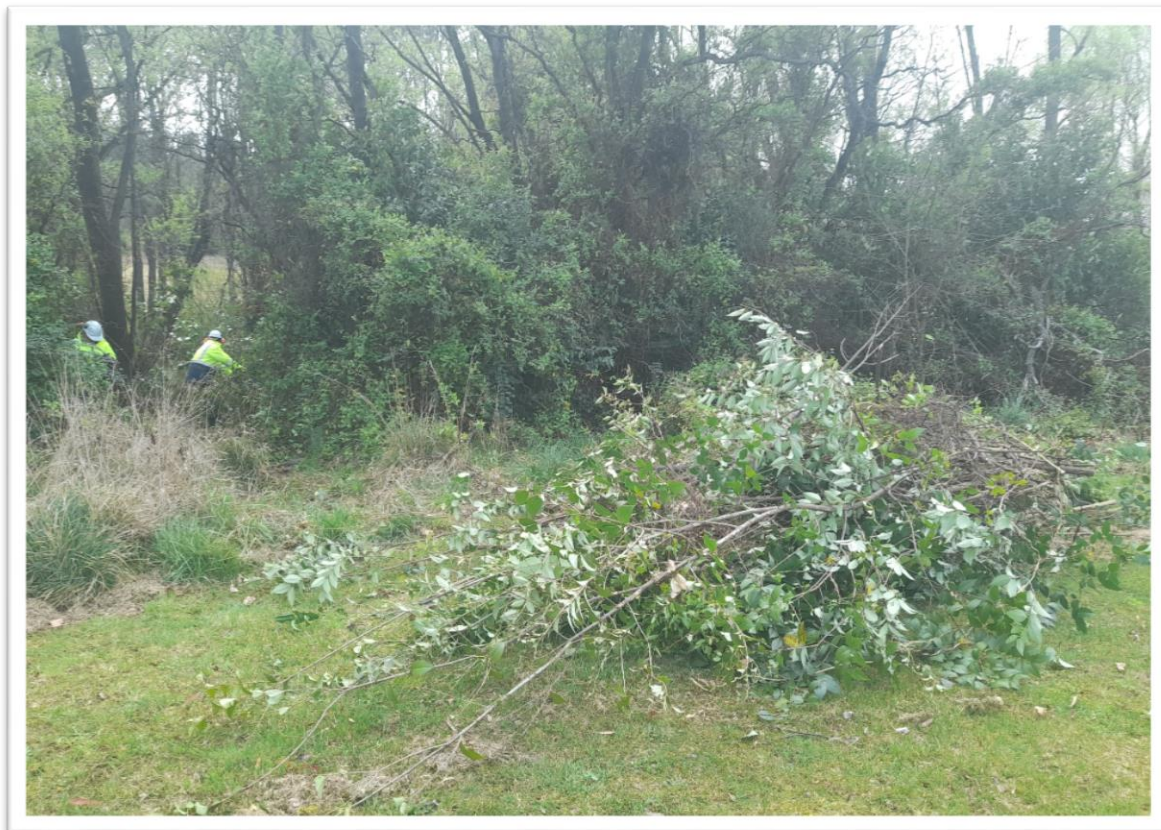
NEWA staff removing privet weeds along Stoney Creek at Uralla Caravan Park