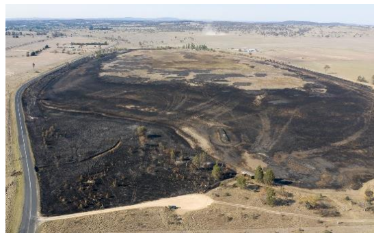
Dangar's lagoon after a fire in 2019