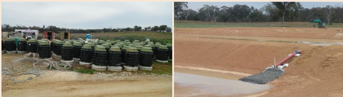
Figure 3: Ongoing construction works and equipment at the Bundarra Sewage Treatment Plant

The construction contract was awarded in December 2020, with a 12-month construction timeframe.